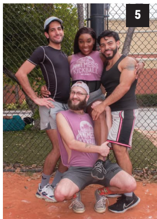
(3) Art Deco Welcome Center/ Miami Design Preservation League