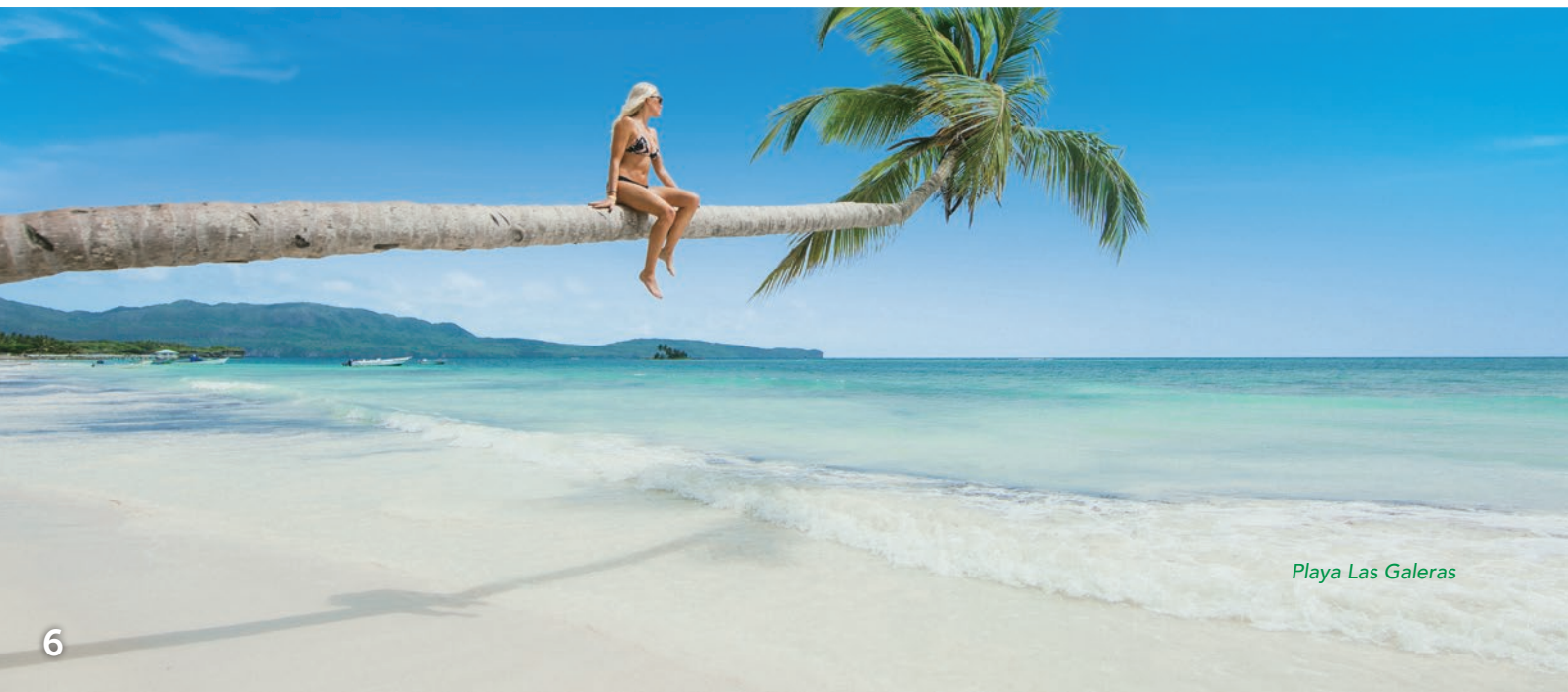
Playa Las Galeras

Download our free app Go Dominican Republic , available in the App Store and on Google Play.