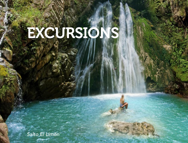
Salto El Limón