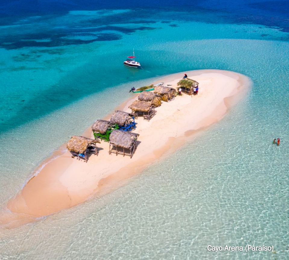
Cayo Arena (Paraíso)