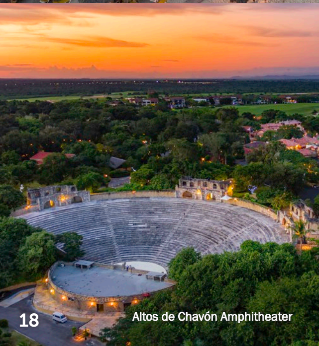
Altos de Chavón Amphitheater

SAONA ISLAND: With excursions departing from Bayahibe, Saona Island is part of the Cotubanamá National Park, and its pristine beaches are the main draw. Saona Island is home to some 112 species of birds in addition to turtles, sharks, bottlenose dolphins and manatees, making it a unique spot for romantic declarations.