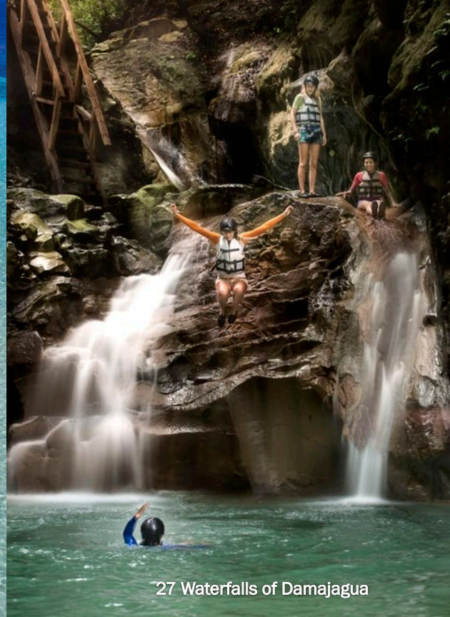
27 Waterfalls of Damajagua

MOUNT ISABEL DE TORRES: Get engaged in the heavens, or at least pretty close, while taking a suspended cable car 2,565 feet (781 meters) up to the top of Mount Isabel de Torres at the foot of the shores of Puerto Plata. Enjoy the magnificent views of the Atlantic Ocean while a statue of Christ the Redeemer awaits at the top, surrounded by beautiful gardens.