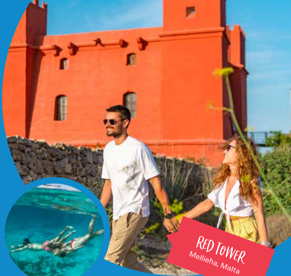
RED TOWER Mellieħa, Malta

As important as your big day is, you'll want to bookend it with a relaxing time for you, your family and friends. That's why Malta is such an exciting place to choose . The history and the sights are incredible. See temples that are older than the Pyramids, marvel at the splendid architecture of the Knights of St John, spot the legacy of the British era in red phone and letter boxes, enjoy a boat trip or a harbour cruise or spend time by the pool or at the beach.