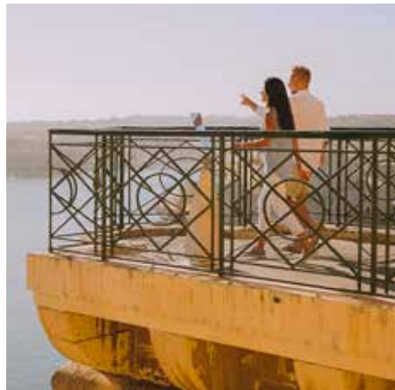
Upper Barrakka Gardens, Valletta, Malta

Communication is easy - English is an official language, together with Maltese, and is spoken everywhere. A wedding should be unforgettable . In Malta, yours will be. A wide selection of wedding venues is on offer, from modern to historic, both indoors and open air. Your special day could be a simple but refined ceremony on the beach or be as grand as you desire in a real castle.