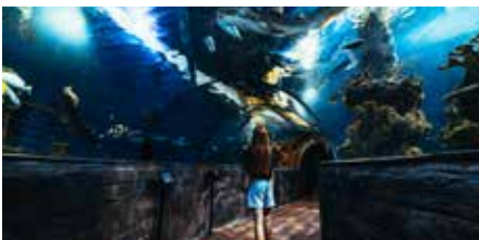
📍 Malta National Aquarium, Bugibba

Malta has a great variety of accommodation to meet your needs, from self-catering to five-star hotels, and no shortage of good quality restaurants, bars and clubs. Sightseeing offers temples older than the Pyramids, breathtaking architecture in Valletta and the stunning Grand Harbour .