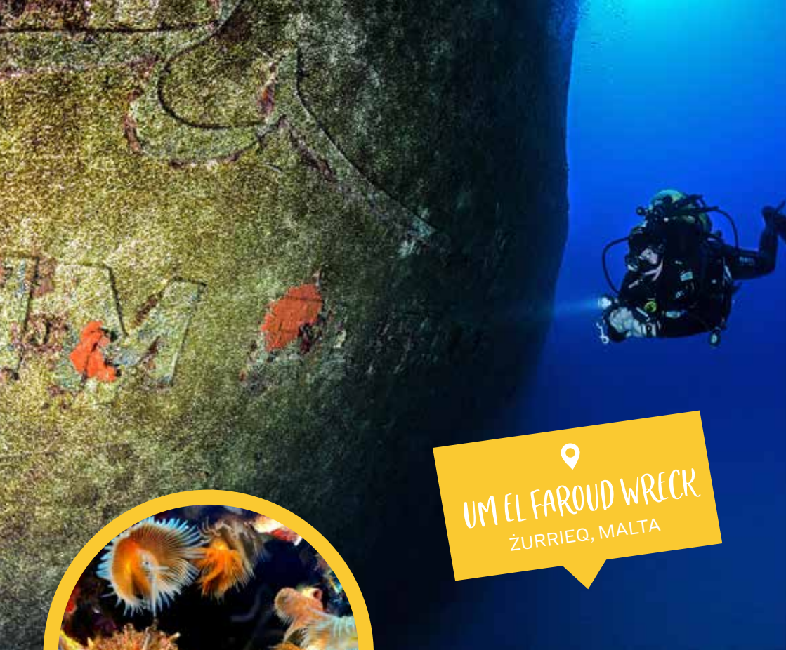
📍 UM EL FAROUD WRECK ŻURRIEQ, MALTA