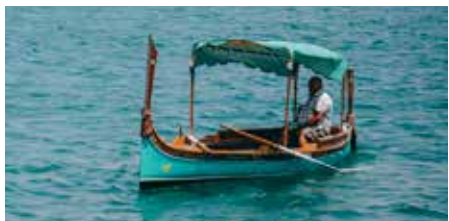
📍 Maltese Dghajsa, Grand Harbour, Malta