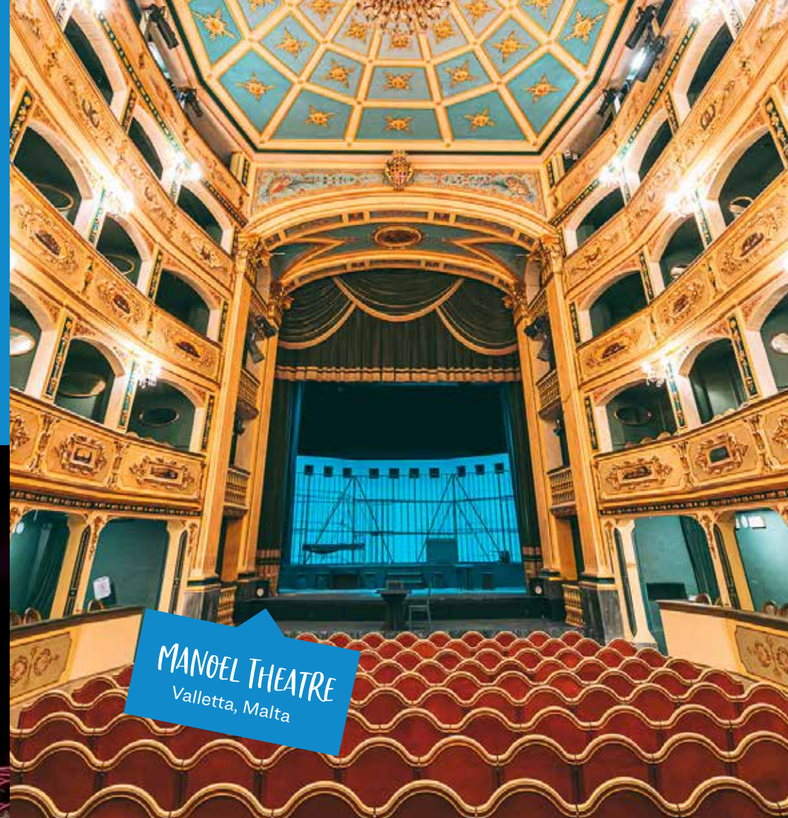
MANOEL THEATRE Valletta, Malta

The international renowned opera singer Joseph Calleja comes home to perform in Malta every summer at an outdoor concert.